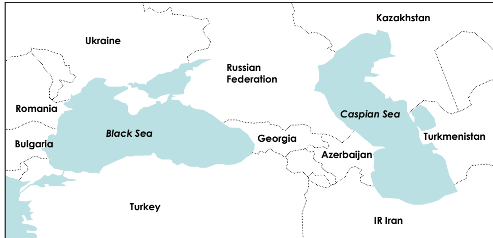
Figure 1: The Caspian Sea, Black Sea and Central Eurasia showing the littoral States.

TotalEnergies gave notice that they would not renew OSPRI membership in 2026 due to changing risk profile.