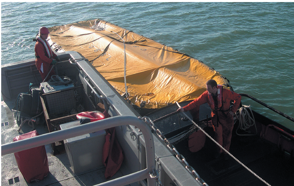
A Lancer barge being used for temporary storage

Caution should be applied to this rule for thicker slicks of more viscous emulsified product. If the oil is thick and the encounter rate good, the amount of water recovered will be minimal because the skimmers will be operating at their most efficient. In this case, the water droplets will be suspended in a continuous oil phase and will take longer to reach the oil/water interface, hence there is potential for much longer separation times. Settling and rates of gravity separation in the case of thicker slicks of higher viscosity oils are therefore a function of the oils' viscosity (S.L. Ross, 1999).